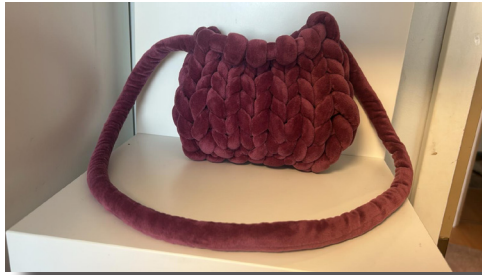
شعبہ صنعت و دستکاری نرگس یونس